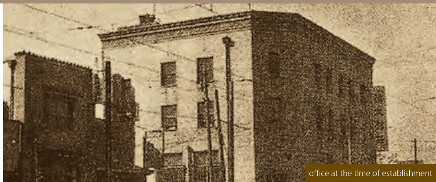
office at the time of establishment

Established Hirose Seizaburo Shoten Co., Ltd., and started the sheet-pile leasing business.