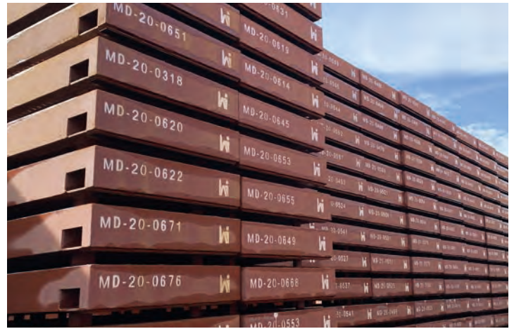
Road Deck Panels